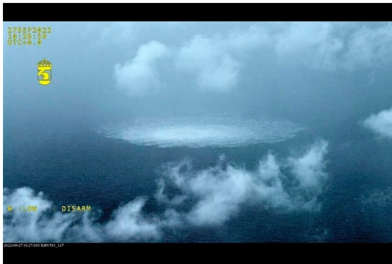
Gas bubbles from Nord Stream pipeline in the Baltic Sea

President Biden and his foreign policy team — National Security Adviser Jake Sullivan, Secretary of State Tony Blinken, and Victoria Nuland, the Undersecretary of State for Policy — had been vocal and consistent in their hostility to the two pipelines, which ran side by side for 750 miles under the Baltic Sea from two different ports in northeastern Russia near the Estonian border, passing close to the Danish island of Bornholm before ending in northern Germany.