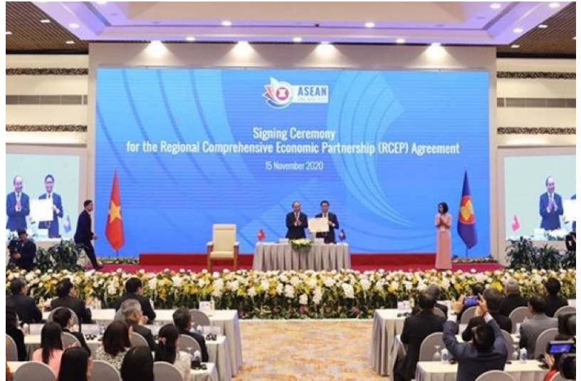
Signing ceremony for the Regional Comprehensive Economic Partnership

On November 15, 15 Asia-Pacific countries signed the Regional Comprehensive Economic Partnership (RCEP). Communist Chinese Premier Li Keqiang touted the RCEP as “a victory of multilateralism and free trade.” When ratified, the RCEP is set to be the world’s largest economic integration scheme, with its 15 countries accounting for 2.2 billion people — just over 28% of the world’s population — and a total of $26.2 billion in Gross Domestic Product.