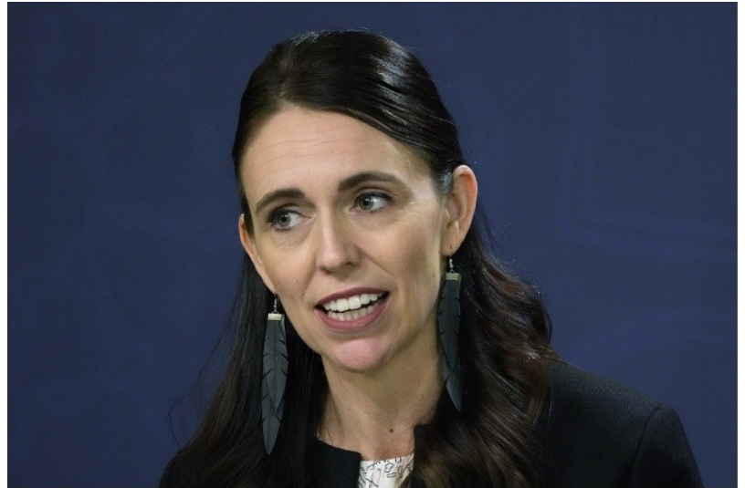
Jacinda Ardern

Ardern elaborated that she had not made any particular plans for the future besides spending more time with her family.