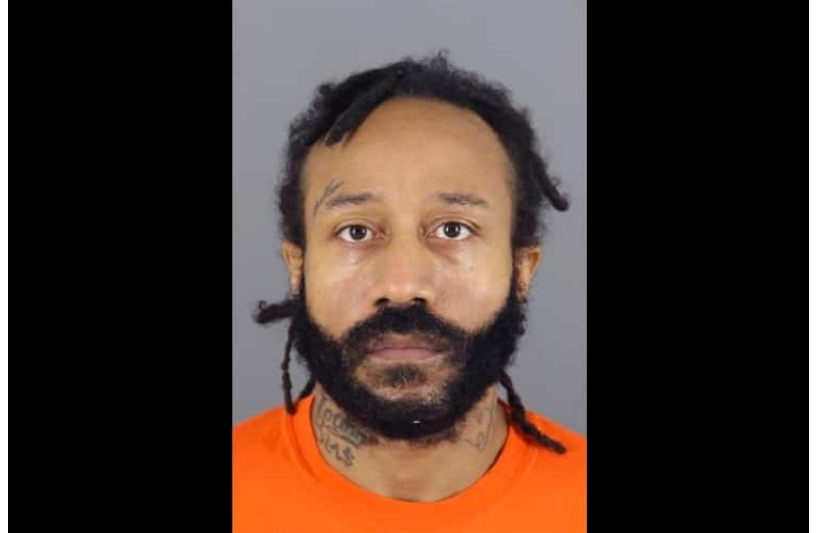
Darrell E. Brooks, Jr.

In other words, had Brooks been in jail where he belongs, he wouldn't have been able to mow down 53 people as he fled the scene of yet another crime. Five of those people are dead thanks to the leftists who run the Milwaukee district attorney's office.