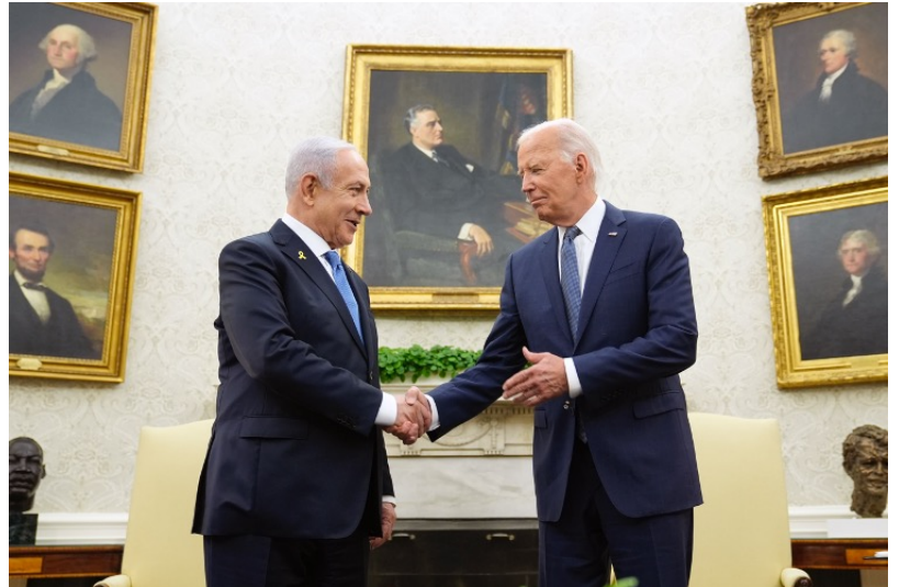
Benjamin Netanyahu and Joe Biden

Biden reiterated his support for Israel's right to defend itself against Iran and its proxies during a later call with Jewish American rabbis.