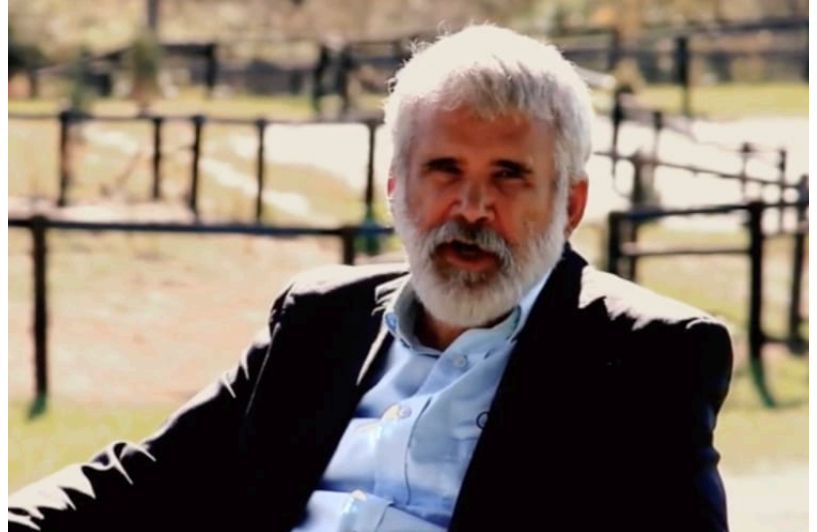
Dr. Robert Malone

Malone announced the suspension on Substack, although his Twitter followers likely knew before then that the anti-free speech outfit had deep-sixed his account.