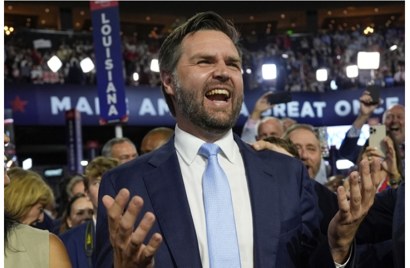
J.D. Vance

Not long after Trump announced the pick on his Truth Social website, the party officially nominated Vance at the GOP National Convention underway in Milwaukee, Wisconsin.