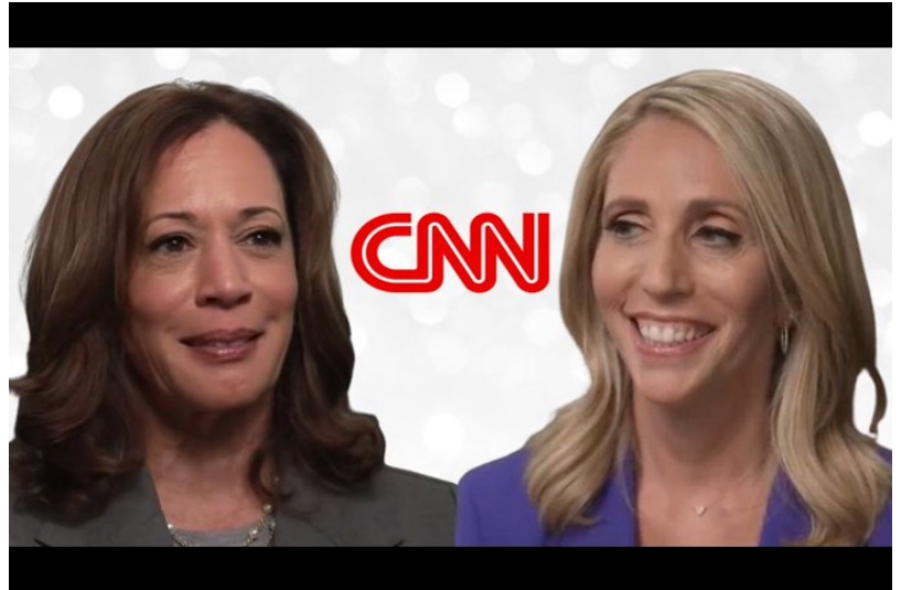
The Vigilant Fox/X

If true, the network scrapped more than half the interview.