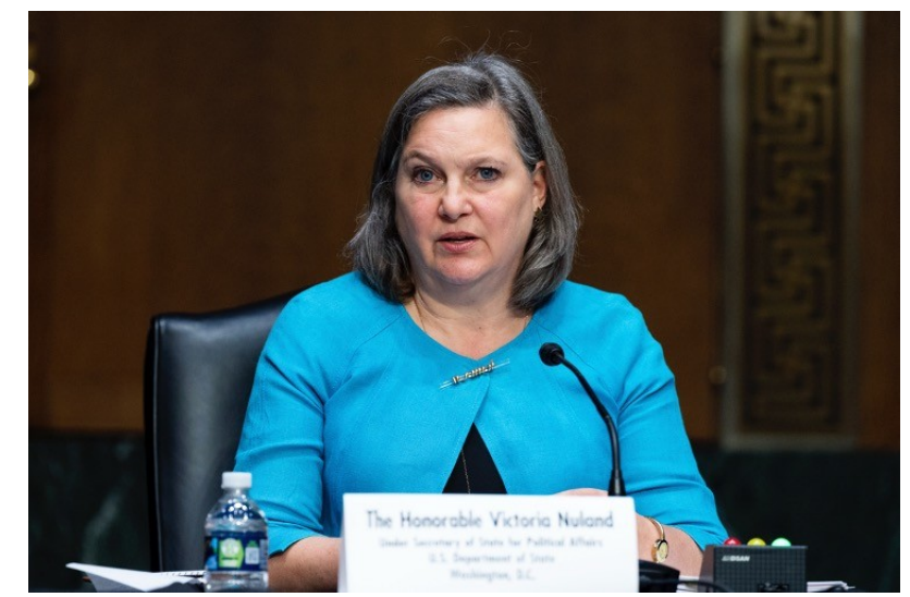
Victoria Nuland

On Tuesday, Russia's ambassador to the United States and its Foreign Ministry spokesman both said Russian troops had uncovered labs in Ukraine, a claim the State Department denied and called projection on Russia's part. Russia frequently accuses other countries of activities in which Russia is engaged.