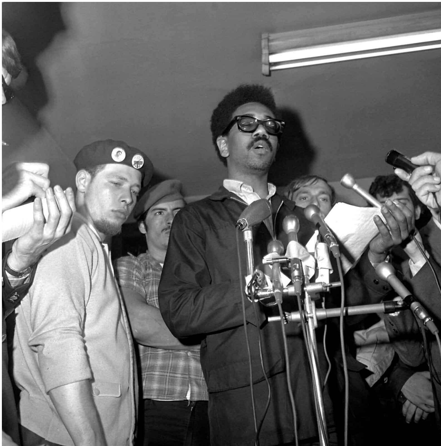
Bobby Rush in 1969

about their dreamed-of socialist-communist victory.