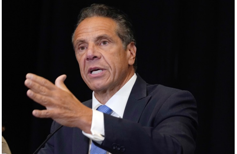
Andrew Cuomo

And, indeed, the RealClearPolitics (RCP) average of polls for the 2024 presidential election shows that Trump is crushing his GOP opponents. Not a single GOP contender is even close.