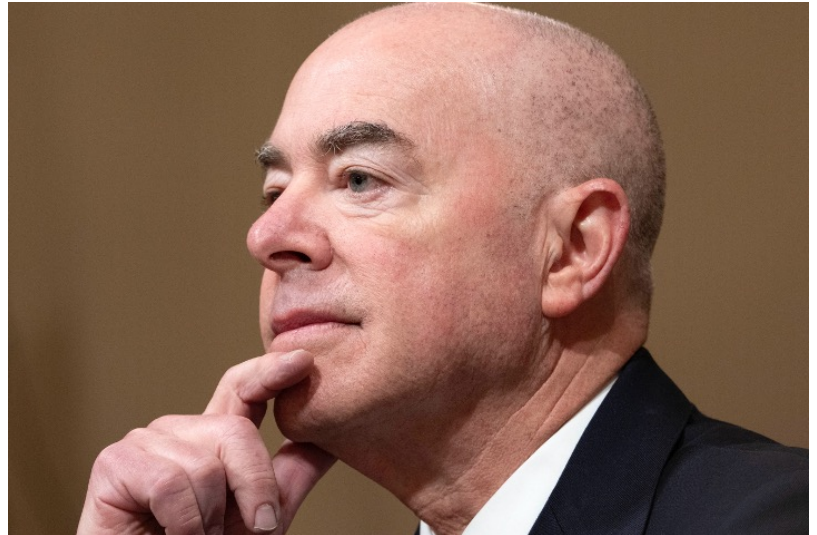
Alejandro Mayorkas

Whew! It certainly will be a relief to border states to learn that the millions of migrants illegally streaming into our country won’t be addressed with the “wrong” pronouns.