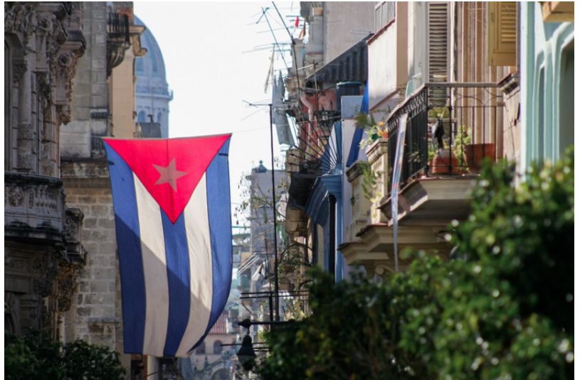
Havana, Cuba