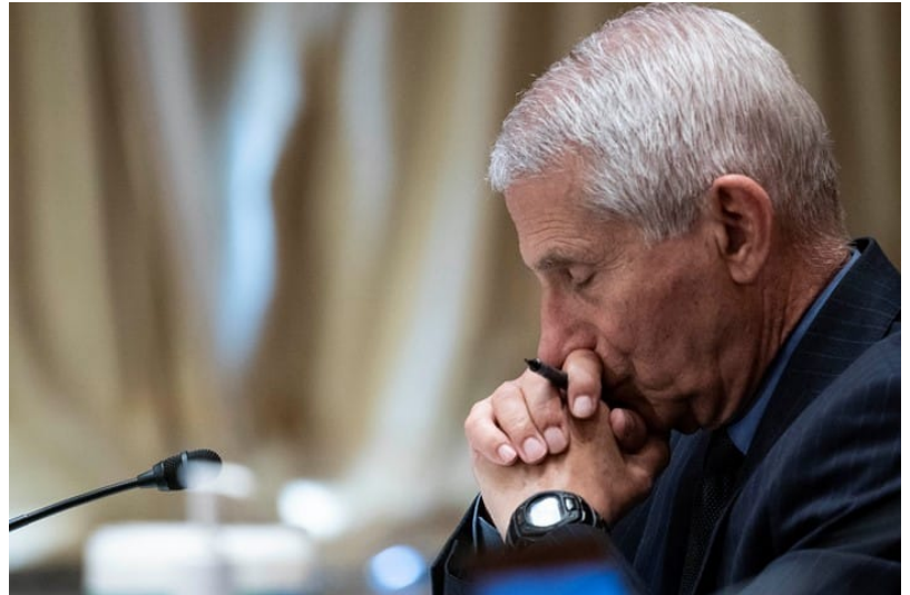
Dr. Anthony Fauci, director of the National Institute of Allergy and Infectious Diseases