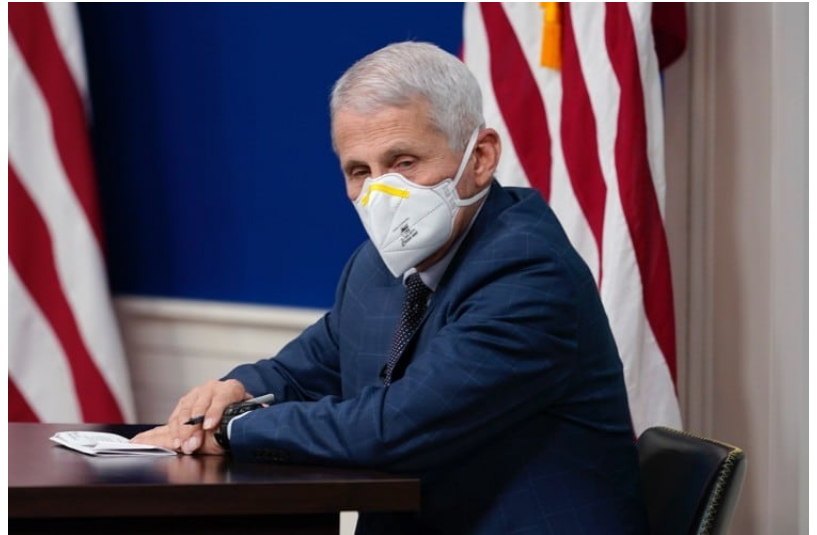
Anthony Fauci

So, I think it becomes a question of how do you put all this together, whether you believe in this series of coincidences, what you know of the lab in Wuhan, how much could be in nature — accidental release or natural event? I am 70:30 or 60:40.