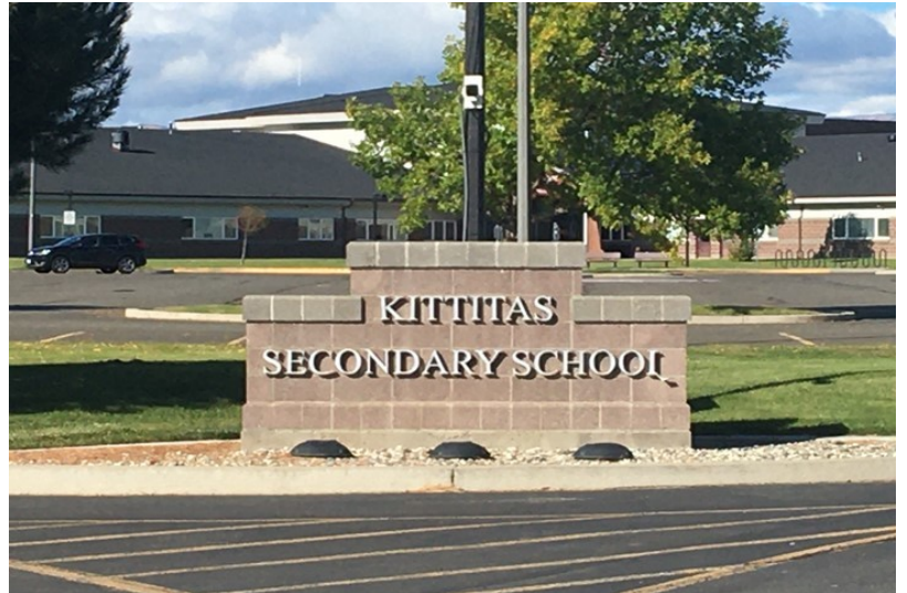
Kittitas, Washington / Photo by Annalisa Pesek

False reports from the Kittitas County Public Health Department on September 10 stated that an “uncontrolled COVID spread” threatened a 14-day closure of the Kittitas School District, whereupon radical teachers and administrators coerced a select group of students into mandatory COVID-19 testing on school property, with many children pressured to submit to testing without parent permission.