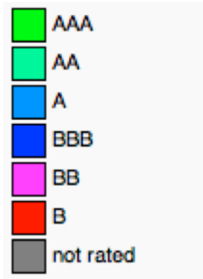
Graphic: Credit rating of governments around the world by Standard & Poor's