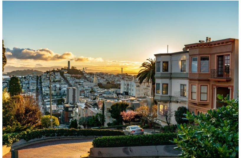
San Francisco

That the group was even permitted to protest suggests that "intolerance" wasn't the City by the Bay's problem. That aside, the once-wonderful city will dish out big checks to lazy "transgenders" more interested in cross-dressing than working.