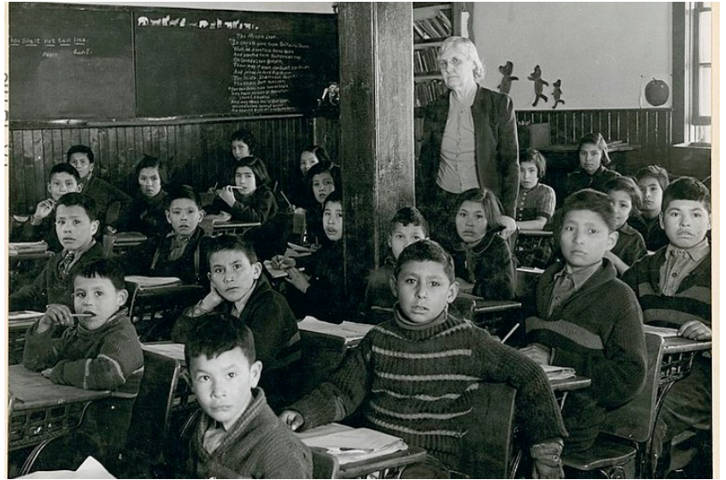
Children at Canadian residential school

“The BBC also hid the ball , reporting about the hundreds of graves found on school properties, only to admit about halfway through the essay that the ‘graves’ were found using ‘ground-penetrating radar,’” Widburg continues. “ This BBC story reflects the same pattern of accusation, followed by the admission