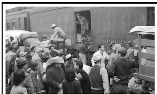
Above: Japanese Americans board a train bound for the Manzanar concentration camp where they will be interned during World War II. Below: A view of the Manzanar camp.