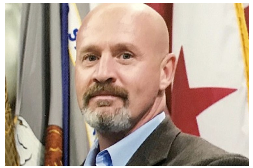
Photo of Glenn Kirshner

As for Kirschner's "1984 is an instruction manual" endeavor," any "American business refusing to take this pledge, regardless of their own personal beliefs, will presumably be subjected to the cancel mob," writes Legal Insurrection.