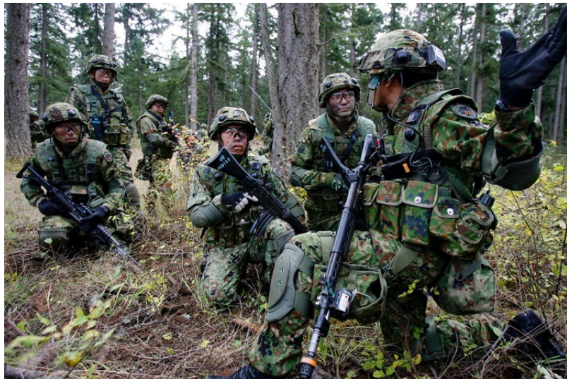
U.S. Army Japanese infantry

"China's dangerous and coercive actions throughout the Indo-Pacific, including around Taiwan, toward the Pacific Island countries, and in the East and South China Seas, threaten regional peace and