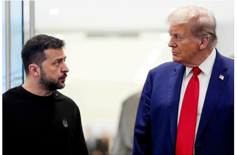
Volodymyr Zelensky and Donald Trump

We're telling Ukraine — they have very valuable rare earth. We want what we put up to go in terms of a guarantee. We want a guarantee. We're handing them money hand over fist. We're giving them equipment.... We're looking to do a deal with Ukraine, where they're going to secure what we're giving them with their rare earth and other things.