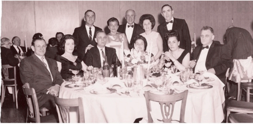
The leaders of the Bielski family partisans eventually emigrated to the United States. They are seated with their wives: Yehuda (left) and Lola, Zus and Sonya, and Lilka and Tuvia.