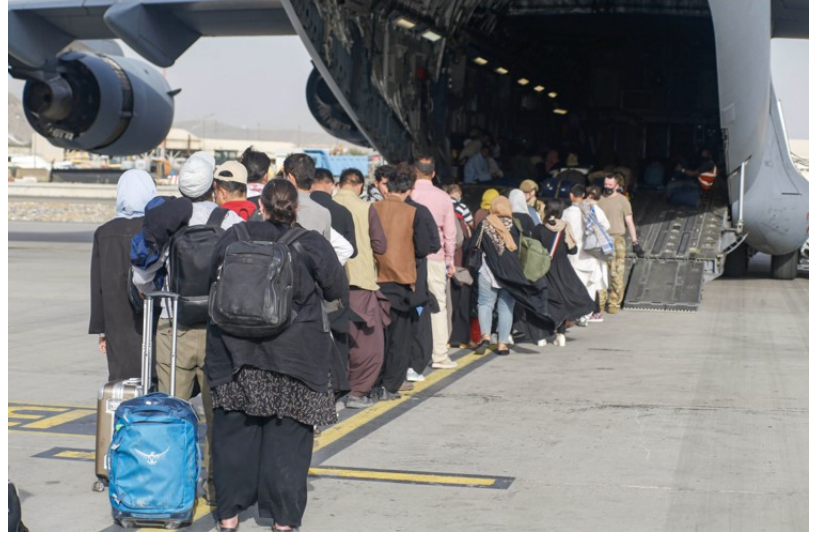
U.S. Department of Defense

In fact, of the 100,000 people evacuated thus far from Afghanistan, only 5,000 have been American citizens. How many of the other 95,000 will commit terrorist acts in the West? Time will tell — even if our government won't.