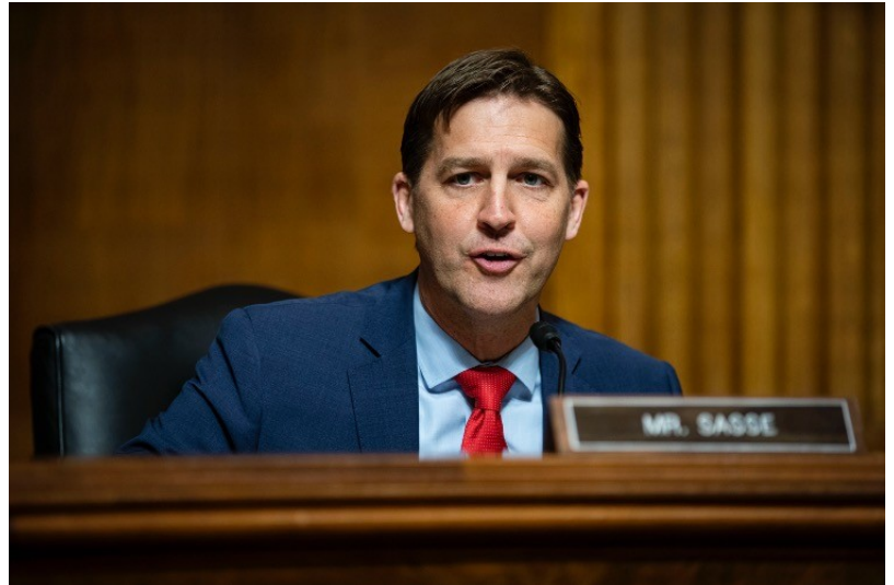
Ben Sasse

In other words, as Fox News's Chris Wallace told Sasse on Fox News Sunday , the GOP is divided on the matter. It shouldn't be. The Taliban victory in Afghanistan is an excuse to import even more Third World refugees and future Democrat voters. And some in the GOP, such as Sasse, favor it.