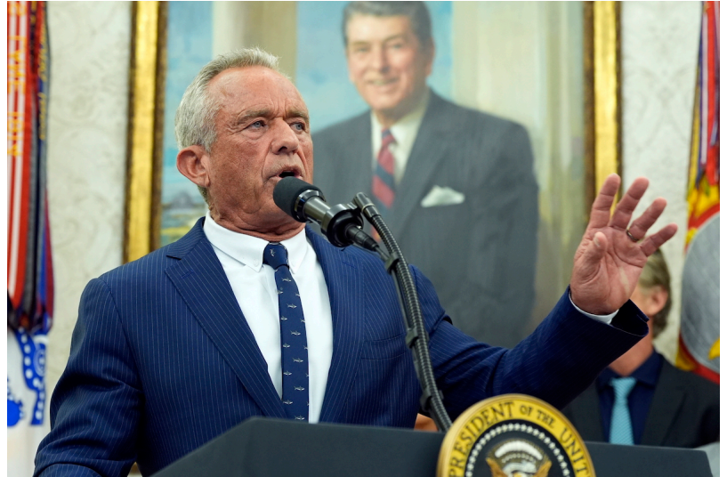
Robert F. Kennedy, Jr.

Kennedy, who has repeatedly criticized vaccines as unsafe, avoided giving a direct answer, stating, "We don't have good data on it, and that is a crime. The fact that we don't have a surveillance system that actually works."