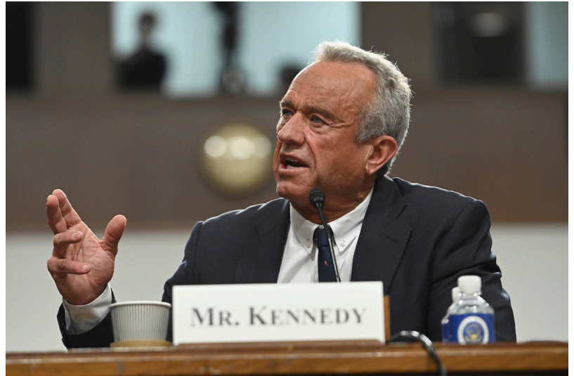
Robert F. Kennedy, Jr.

Kennedy opened with his usual routine of describing the condition of America's collective health. More than 70 percent of American adults and one-third of children are overweight or obese, he said. Diabetes