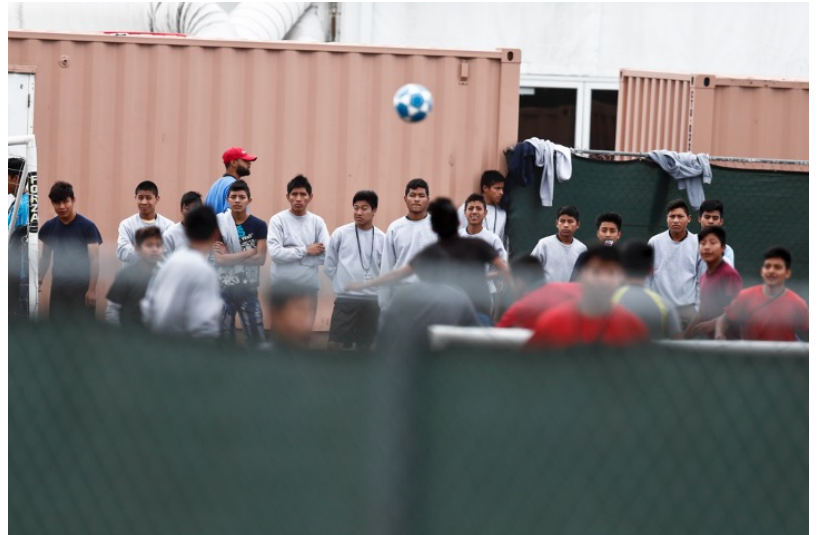
Illegal, unaccompanied minors