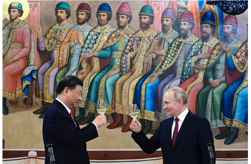
Putin and Xi meeting in December 2023

Putin and Xi maintained their commitment to working together at various forums, including the UN, BRICS, and the Shanghai Cooperation Organization, and exchanged opinions on pressing international matters, especially the Middle East conflict, the statement added.