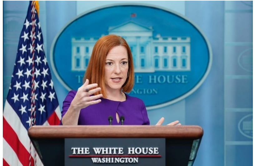
Jen Psaki

Ending her typically worthless opening comments yesterday, Psaki fired upon states such as Alabama that are passing laws to stop doctors reinforcing the false belief a kid might be "trans." Part of reinforcing that falsehood is prescribing "treatment." That includes anything from "affirming" the child's true "gender," to prescribing puberty blockers, and then, horrifyingly enough, to performing irreversible surgeries.