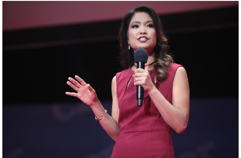
Gage Skidmore/Wikimedia Commons Michelle Malkin

Bizarrely, the Deep State opportunists milking Jan. 6 for all its political worth argue that it would be a danger to national security to allow Anderson, the media and the public to have access to the 30-second exculpatory clip at issue. In response to Medvin's motion, the government cites the so-called mosaic theory to justify protecting video footage from the Capitol police force's closed-circuit video system. Every individual piece of video evidence must be protected from disclosure, the prosecutors' argument goes, to prevent nefarious operatives from piecing together in aggregate the exact locations of the