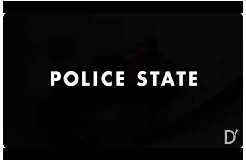
"Police State" trailer

KGB. Gestapo. Stasi. DGI. We all know the names. Every totalitarian regime has its enforcement arm, its dreaded police apparatus. These evil entities exist to strike terror into the hearts of citizens and make them comply with the regime's dictates. Americans have been uniquely blessed not to have a national police force that could be bent in that despotic direction. In establishing our Constitution, the Founders wisely placed police powers in the hands of state and local governments. But that has changed.