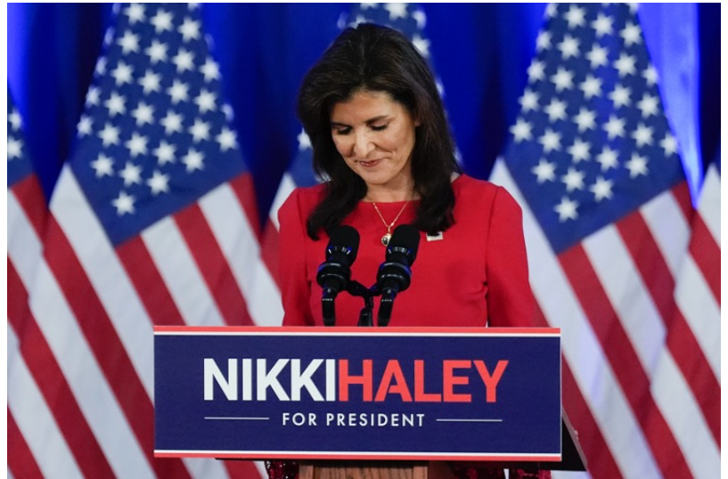
Nikki Haley

Nikki Haley got TROUNCED last night, in record setting fashion, despite the fact that Democrats, for reasons unknown, are allowed to vote in Vermont, and various other Republican Primaries. Much of her money came from Radical Left Democrats, as did many of her voters, almost 50%, according to the polls. At this point, I hope she stays in the “race” and fights it out until the end! I’d like to thank my family, friends, and the Great Republican Party for helping me to produce, by far, the most successful Super Tuesday in HISTORY, and would further like to invite all of the Haley supporters to join the greatest movement in the history of our Nation. BIDEN IS THE ENEMY, HE IS DESTROYING OUR COUNTRY. MAKE AMERICA GREAT AGAIN!!!