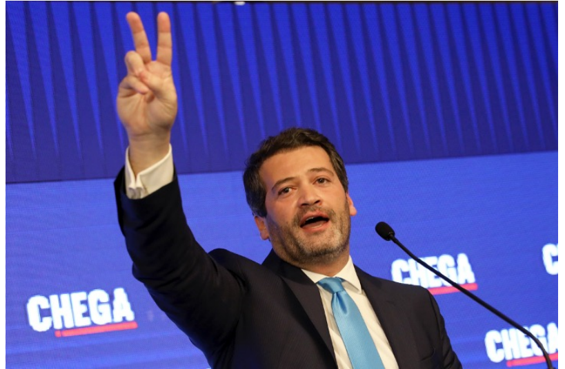
AP Images Andre Ventura

The Chega party thanked voters on X , stating, "Obrigado, Portugueses!" Party leader Ventura said that the Portuguese voters have changed, writing on X , "Yesterday Portugal woke up and changed. Now we have a lot of work and a lot of responsibility. Count on us!"