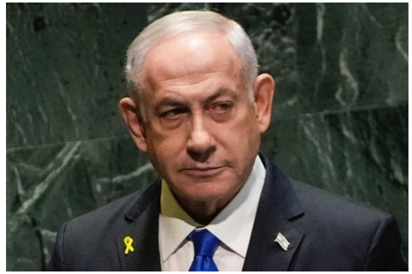
Benjamin Netanyahu

The attempt by Iran's proxy Hezbollah to assassinate me and my wife today was a grave mistake. This will not deter me or the State of Israel from continuing our just war against our enemies in order to secure our future. I say to Iran and its proxies in its axis of evil: Anyone who tries to harm Israel's citizens will pay a heavy price. We will continue to eliminate the terrorists and those who dispatch them. We will bring our hostages home from Gaza. And we will return our citizens who live on our Northern border safely to their homes. Israel is determined to achieve all our war objectives and change the security reality in our region for generations to come. Together, we will fight, and with God's help — together, we will win.