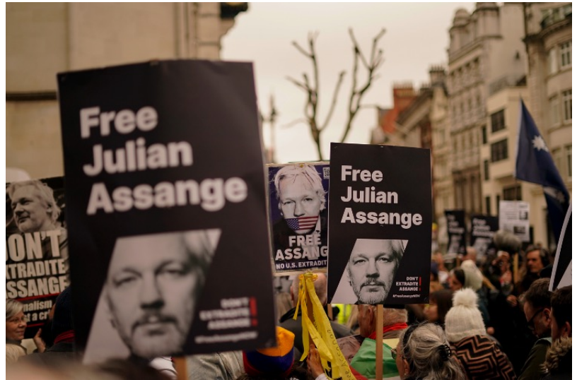
Pro-Assange protest in London

Assange's lead lawyer told the court today, "Mr Assange is being prosecuted for engaging in ordinary journalistic practices of obtaining and publishing classified information which is true and of public interest," maintaining Assange's defense when he told a British court in 2019 , "I do not wish to surrender myself for extradition for doing journalism that has won many, many awards and protected many people."