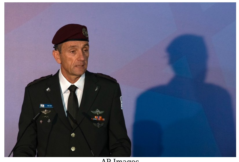
Herzi Halevi

— Permanent Mission of I.R.Iran to UN, NY (@Iran_UN) April 13, 2024