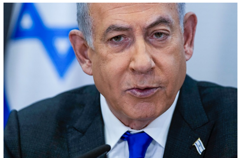
Benjamin Netanyahu

The ICC alleges Netanyahu and Gallant are responsible for the starvation and willful killing of Palestinian civilians, stating: