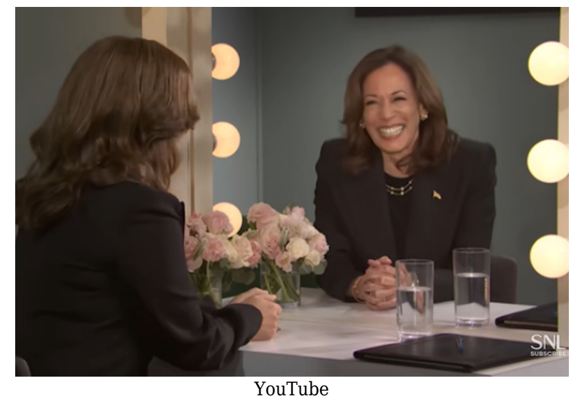
Kamala Harris in a last-minute appearance on NBC's Saturday Night Live

This is a clear and blatant effort to evade the FCC's Equal Time rule. The purpose of the rule is to avoid exactly this type of biased and partisan conduct — a licensed broadcaster using the public airwaves to exert its influence for one candidate on the eve of an election. Unless the broadcaster offered Equal Time to other qualifying campaigns.