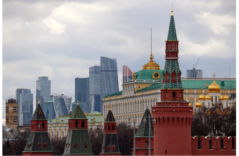
AP Images Moscow

As the Associated Press reported, Russian police conducted raids of gay clubs and bars in the capital city of Moscow on Friday. The operation came less than two days after the Russian Supreme Court ruled that the “global LGBT movement” is an “extremist group.”