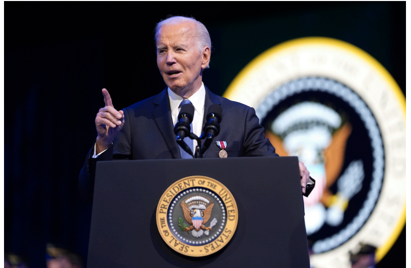
Joe Biden

If so, then Biden's orders and pardons were "unconstitutional and legally void," he wrote on X.