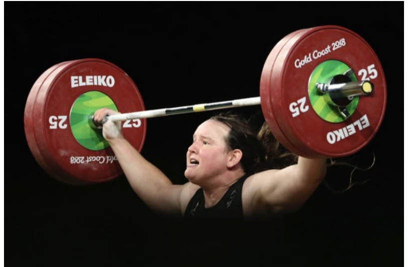
Laurel Hubbard

Apparently, Tokyo-bound Hubbard competes well against women, which would make sense because he's a man.