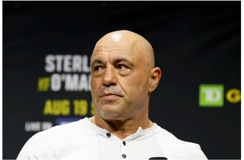
Joe Rogan