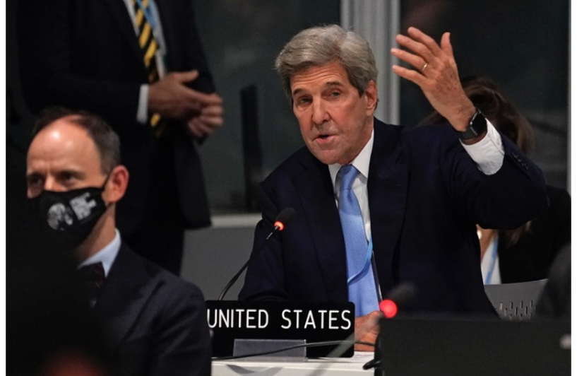
John Kerry

It really is a theme with the greentopians: Barack Obama said in 2008 that anyone who built a coal plant under his cap-and-trade plan would go bankrupt. Saule Omarova, Joe Biden’s Comptroller of the Currency nominee, stated in February that she wants to “bankrupt” the energy industry’s “small players.” Now White House “Climate Envoy” and ex-presidential candidate John Kerry has vowed to destroy tens of thousands of jobs. Specifically, while speaking this week at the COP26 climate summit in Glasgow, Scotland, Kerry said, “By 2030 in the United States, we will not have coal plants.”