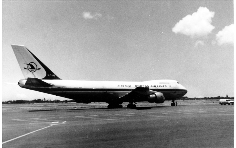
This Korean airliner, shown in 1982, was shot down by the Soviets on Sept. 1, 1983.

Eight years after the downing of Korean Air Lines Flight 007 by the Soviets on September 1, 1983, the most important questions about the incident remain unanswered. The most widely accepted view is that the airliner was indeed blown up, after which it plummeted into the Sea of Japan, killing all 269 persons (including 61 Americans) on board. But the main wreckage was not found, and no bodies positively identified as having been aboard Flight 007 were ever recovered.