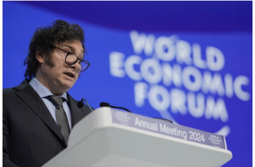
Javier Milei

Monopolies typically form when there are significant barriers to entry into a market. These barriers can include high start-up costs, regulatory requirements, or patents that protect a company's intellectual property. In many cases, existing companies may also engage in anti-competitive practices, such as price dumping, predatory pricing, or other tactics designed to push out potential competitors.