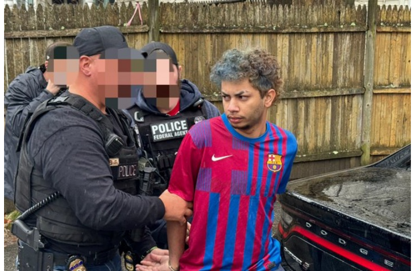
Salvadoran rapist being arrested

ICE issued a detainer for an illegal alien, but an insurrectionist sanctuary state refused to honor it — so the killer was set free, perhaps to kill again.