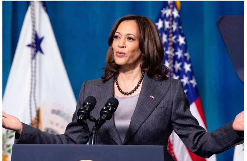
Kamala Harris

— RNC Research (@RNCResearch) March 2, 2022