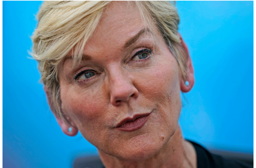
Jennifer Granholm

During her tenure at DOE, Granholm was the focus of multiple allegations of unethical behavior.